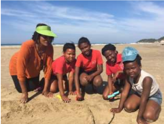
Parents came down to build sand castles with their children.