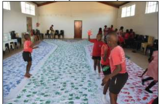
The huge flag created by learners and the Mercedes Benz South Africa team.

Mandela Day 2018 saw a huge team from Mercedes Benz South Africa arrive at African Angels. The MBSA team helped with the round robin of games that each class was participating in, and were instrumental in the creation of a hall sized, hand painted, South African flag. We would like to thank every MBSA team member who came and gave up their day to spend with our children.